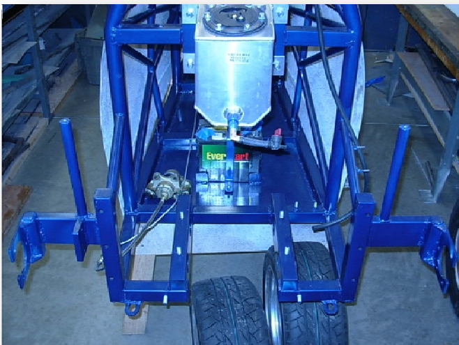
A rear view of the chassis with the front portion of the fiberglass body attached to the car

Over the past two months, Team PDQ has made tremendous headway on finishing our car. Since early February, we completed the new dual exhaust system, started and finished prepping the chassis for paint, painted the smaller parts that could be painted in our spray booth; and finally we sent out our chassis, fiberglass body, and exhaust to be painted. The chassis was painted by Renco Machine, the fiberglass body was painted by NWTC, and our exhaust pipes and muffler are being ceramic coated by Spence Industries. As of the week of this update we are still waiting on our exhaust pipes to be sent back to us. But otherwise we are fairly close to completing our car, and we will be ready to go by the April 25 th track day at Road America in Elkhart Lake, WI.