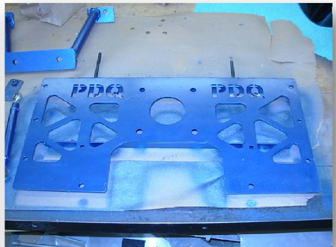
The back plate will go directly behind the engine and connect to the gearbox